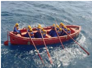
NSA Cadets during their boat drill on board KFO