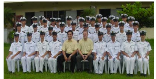
The Promising 13th Batch NSA Cadets from JBLCF