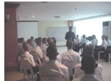
Stress Management Seminar with NSA Cadets