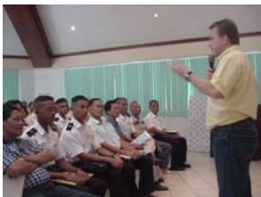
PMMA Parents' and Cadets' Seminar with Project Manager