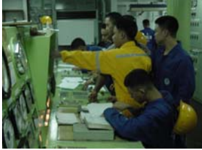
Engine Watch keeping on board T/S KFO