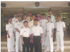
9th Batch Graduates from MAAP