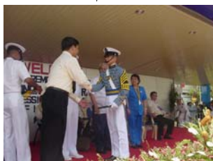
NSA Cadet Beguia, Cum Laude, during the awarding rites at MAAP