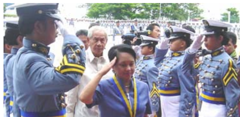
President Gloria Macapagal-Arroyo arrives at MAAP