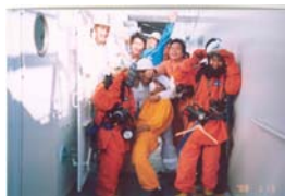
NIS Cadets during Fire-Drill on board

In some cases some of our NIS Members have not signed a Memorandum of Agreement with their Cadets. This might create some problems later after the Cadets have graduated. The NIS Project has only a MOA with the Cadets during their 4 years at school (including the 1 year at sea). After they are finished, it is up the manning agent / ship-owner to sign them up. We recommend that you do so.