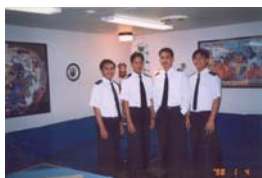
NIS Cadets on board