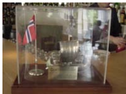
NIS MOS Award

This year's NIS MOSA went to JB Lacson Molo. The award was created to give recognition to the school with remarkable performance according to the NIS Project objectives and mission. The 4 major aspects of the evaluation to ensure