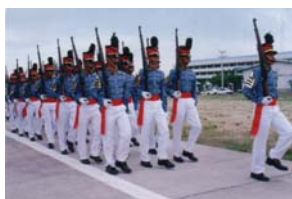
NIS Cadets practicing drills