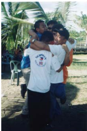
NIS Cadets during Team-building Seminar