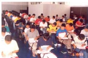
Hopeful Cadets takes the NIS tests