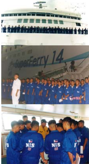
NIS Cadets on board Super-Ferry